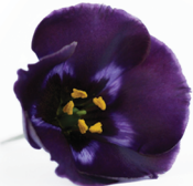
BOHEMIAN black violet