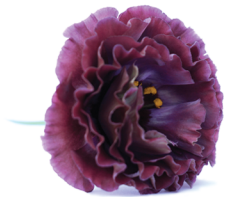
ROSANNE black pearl