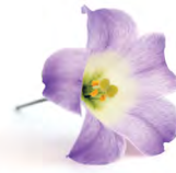
BOTANIC lavender mist