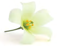
BOTANIC green mist