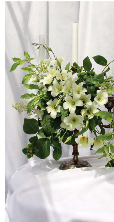
botanic green mist Naturally elegant.

Ideal for creating mono-flower groups with lots of layering.