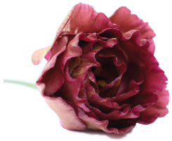
ROSANNE deep brown