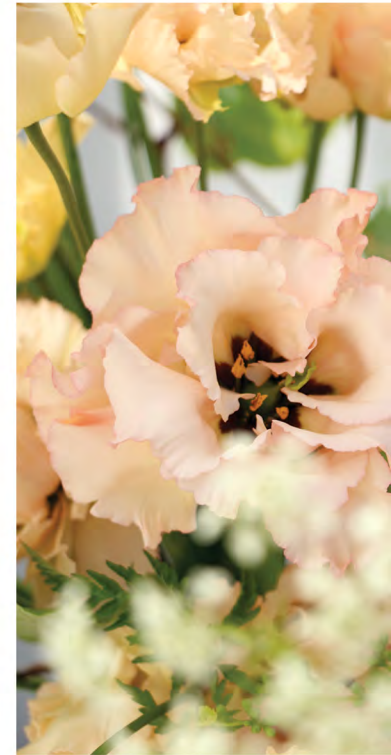
alissa light apricot

Tones of pearly nude with a delicate hint of soft pink.