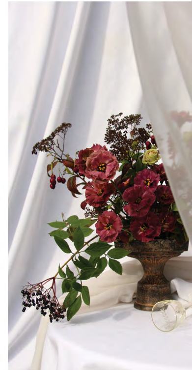
rosanne deep brown

Pretty pink cups with a soft, signature scent; truly unique for its kind.