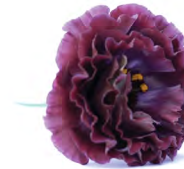
ROSANNE black pearl