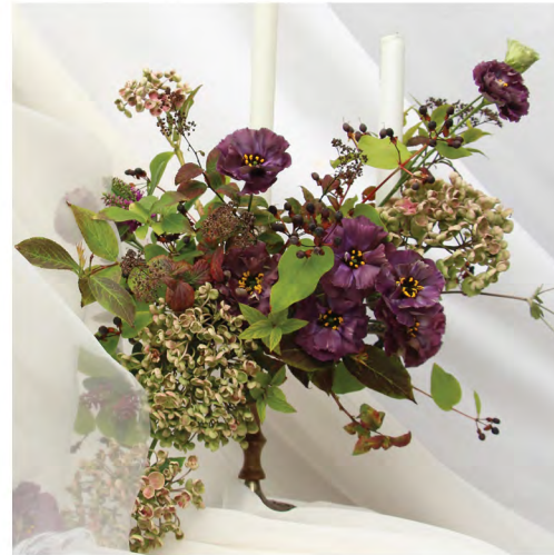
rosanne black pearl

Intense velvety hues of purple for all those decadent arrangements that exude sophistication and passion.