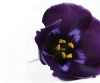
BOHEMIAN black violet