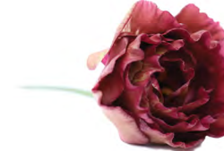
ROSANNE deep brown