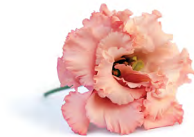
ALISSA light apricot