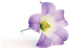
BOTANIC lavender mist