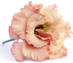
ALISSA light apricot