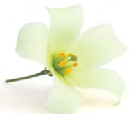
BOTANIC green mist